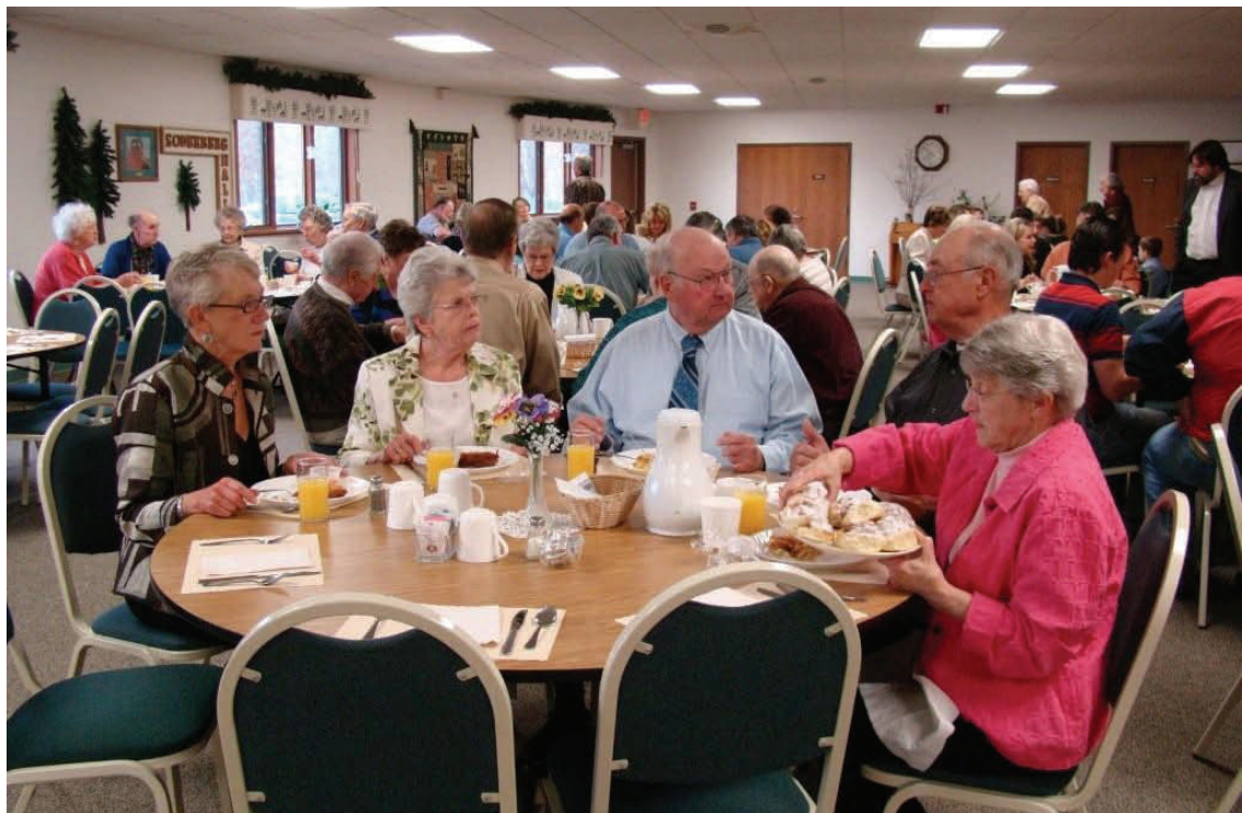
Easter Breakfast 2009