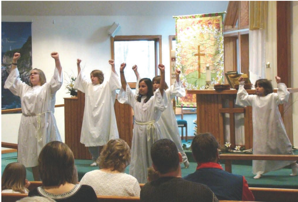
2009 Easter Sunrise Service — Signing the Lord's Prayer